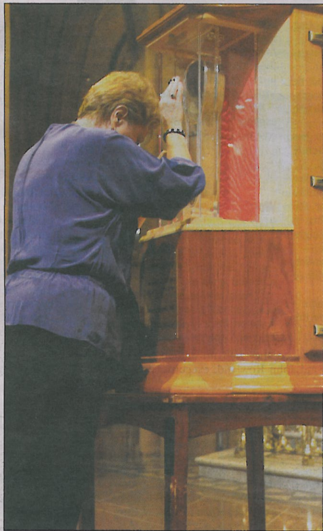
VENERATION: A woman prays before the relic of St Francis in front of the sanctuary of St Mary's Cathedral last Monday.

Prayer intentions submitted online in the lead-up to the